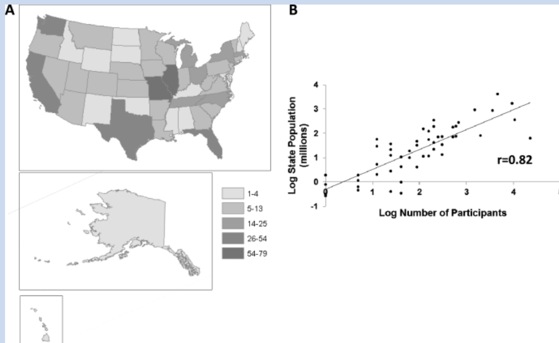
FIG. 3. Representation of NPRI participants by U.S. State/District of Columbia. A: Map of participants by U.S. State. Shading corresponds to the number of participants with darker shading indicating higher numbers of participants. B: Plot of log number of participants in each state by log U.S. Census [2010] state population ( r = 0.82 ).

registry as a virtual laboratory to understand the effectiveness of different recruitment mechanisms for assembling an international population of patients with NF1.